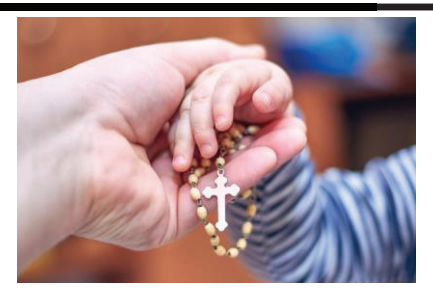
Thank you for your donations